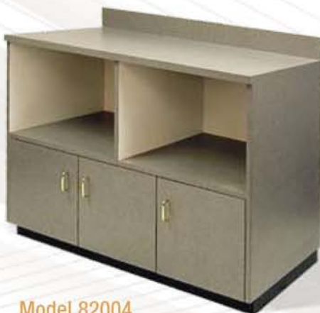
Model 82004 Double microwave cabinet with splash 46" w • 22 1/2" d • 36" h • 4" backsplash