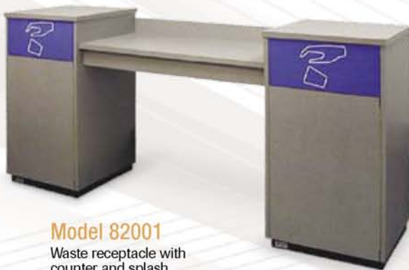
Model 82001 Waste receptacle with counter and splash 43 1/4" h • 26" d • 95" w • 4" backsplash