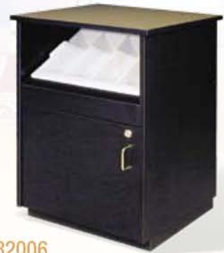
Model 82006 Coffee stand with 4-section condiment bin 23 3/4" w • 19" d • 32" h

Whatever needs your space has for hostess stations, service counters, drink stations, condiment counters, buffet stations and more, Plymold can help. We have laminated cabinets with solid surfaces for a wide range of needs. If we don't have it in stock, we can create whatever you have in mind. We can collaborate with you on your design and then build to your specifications.