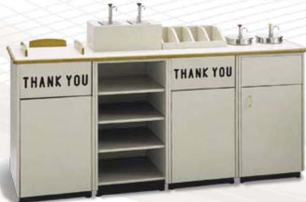
Custom modular unit with 80102 (3), 80105 (1), and quad cabinet top

Drop-in cabinet shown without top 42" h • 23" d • 23" w • Optional Dur-A-Edge®