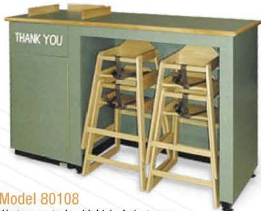
Model 80108 Waste receptacle with high chair storage 43 1/4" h • 26" d • 72" w • 35 gallon liner