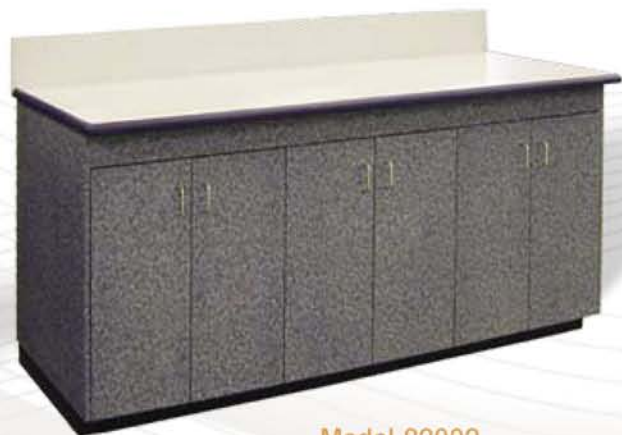
Model 82002 Condiment counter with splash & Dur-A-Edge® top 46" w • 22 1/2" d • 36" h • 4" backsplash