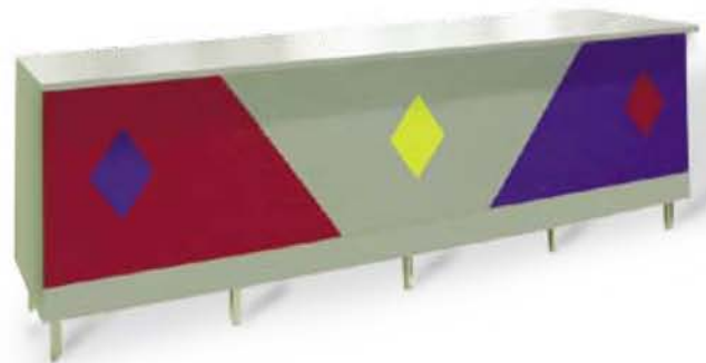
Custom cabinet shown with inlay