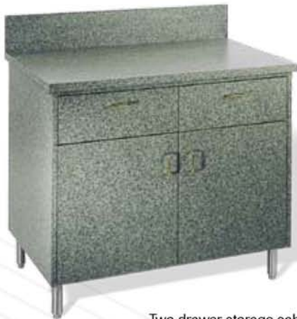
Two drawer storage cabinet