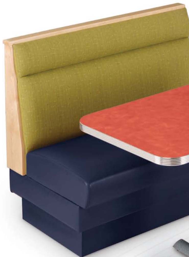
Upholstered booth with removable, replaceable parts.

Our Waste Receptacles stand up to years of repeated use, especially the metal base, which resists impact and won't decay.