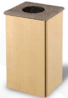
Waste receptacles look great, year after year.

Who pays attention to waste receptacles? Your customers will if they look worn or broken or don't function properly. That's why we've engineered and built our waste receptacles to fit beautifully into your design and withstand years of punishment from your customers and cleaning crew.