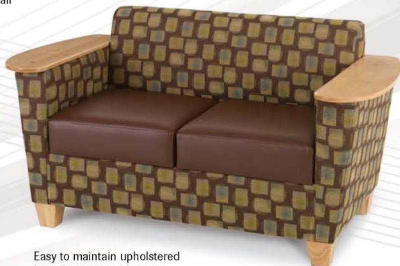
Easy to maintain upholstered Love Seat with tablet arms.