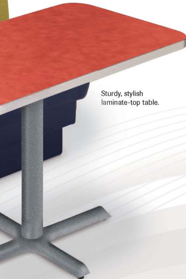
Sturdy, stylish laminate-top table.