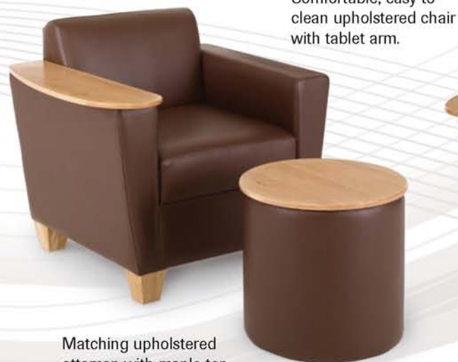
Comfortable, easy to clean upholstered chair with tablet arm.