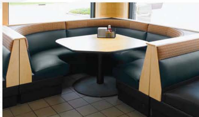
Optional corner booths are great for handling large groups.

We can custom build beverage counters to any specification – straight front, with doors, various shelf configurations,