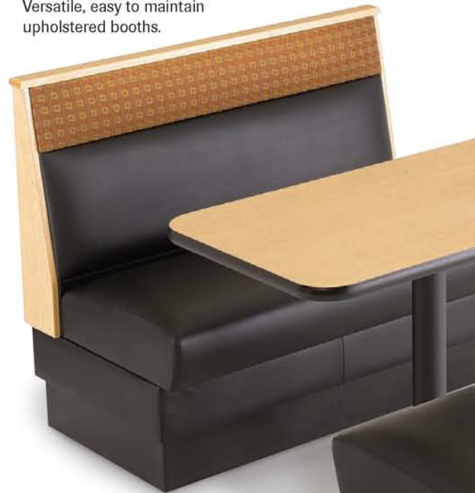
Table Tops & Bases

Versatile, easy to maintain upholstered booths.