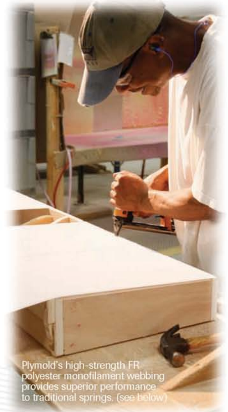
Plymold's high-strength FR polyester monofilament webbing provides superior performance to traditional springs. (see below)

Attention to detail. Precision. Respect for craft. And a keen awareness of creating furnishings that touch people's lives. That's how Plymold builds all of the furnishings for Dairy Queen®. Our people are highly trained, extremely passionate professionals who build enormous value into everything that carries the Plymold name. Anyone can purchase the right materials, but creating truly high quality furnishings is the result of combining leading edge processes and highly skilled, highly motivated people.