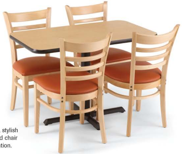
Durable, stylish table and chair combination.

If our wood chairs and stools weren't among the best you could buy, we wouldn't stand for it. We insist on creating chairs that not only match your specifications, but also live up to our building standards.