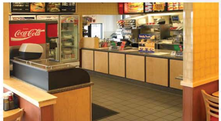
Counters and waste receptacles can be matched to your new DQ Grill and Chill® furniture for a unified, seamless look.